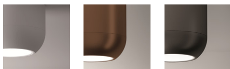
BC Wrinkled white