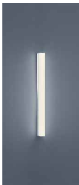
12 W, LED warm weiß / warm white ca. 2900 K, 1040 Lumen 18/1812.04