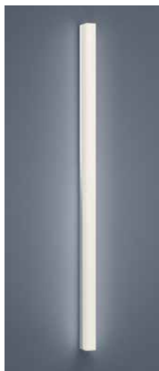
24 W, LED warm weiß / warm white ca. 2900 K, 2080 Lumen 18/1814.04