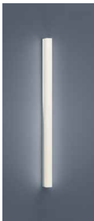
18 W, LED warm weiß / warm white ca. 2900 K, 1560 Lumen 18/1813.04